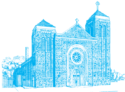
St. John Nepomuc