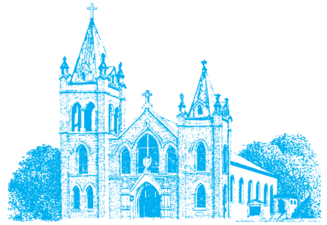
St. Gabriel Archangel